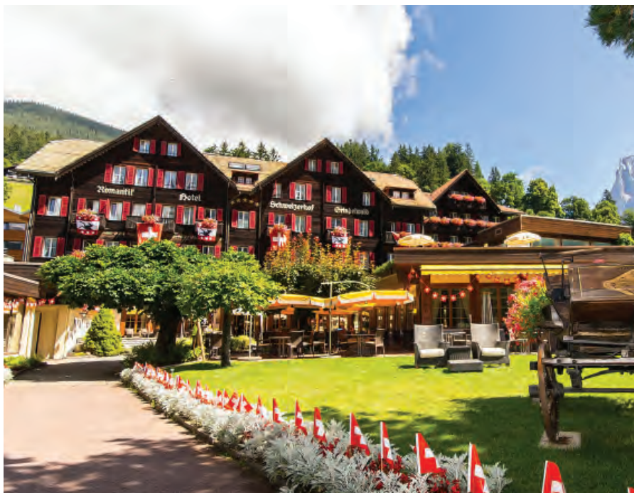
Romantik Hotel Schweizerhof

setting. In the summer, guests can also dine in the Schweizerhof Gardens, or on the romantic terrace. Hot drinks, aperitifs, and cocktails are served in the Hotel Bar throughout the day. The specially crafted Swiss wood seen on the exterior and in the rooms is used again in the bar to create the warm, welcoming feel of a mountain lodge. The Schweizerhof Spa is a chic haven of tranquillity, centred around the relaxing pool. Whirlpools and saunas, with atmospheric mood-lighting, are tucked into steamy corners, and indulgent massages and beauty treatments are administered in private treatment rooms. With two different hotel styles, which both channel two aspects of Swiss culture, the Romantik Hotel Schweizerhof has something to offer each of its guests. Luxurious accommodation, food, and spa facilities come together to create a truly special five star hotel.